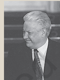
Boris Yeltsin (1931-2007)

The first elected President of Russia (1991-1999); rose to power in the Communist Party and was made the Mayor of Moscow by Gorbachev; later joined the critics of Gorbachev and left the Communist Party; led the protests against the Soviet regime in 1991; played a key role in dissolving the Soviet Union; blamed for hardships suffered by Russians in their transition from communism to capitalism.