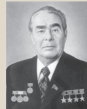
Leonid Brezhnev (1906-82)

Leader of the Soviet Union (1964-82); proposed Asian Collective Security system; associated with the détente phase in relations with the US; involved in suppressing a popular rebellion in Czechoslovakia and in invading Afghanistan.