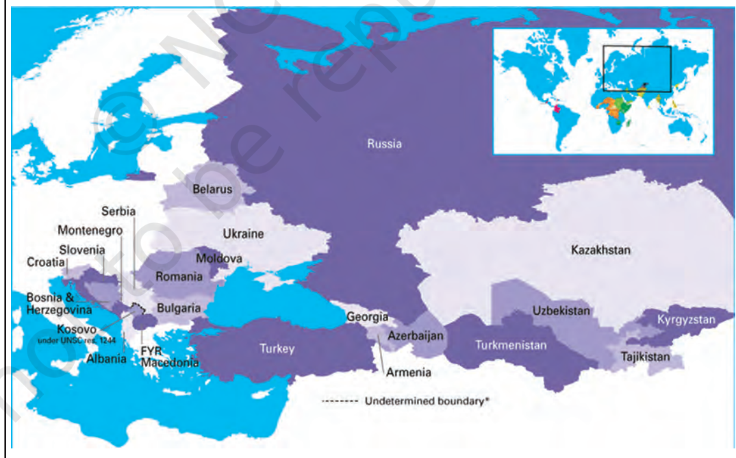
MAP OF CENTRAL, EASTERN EUROPE AND THE COMMONWEALTH OF INDEPENDENT STATES

Locate the Central Asian Republics on the map.