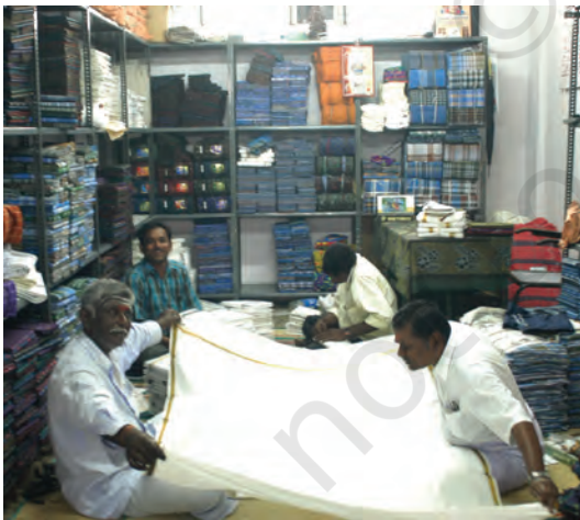
A shop in Erode.

Erode's bi-weekly cloth market in Tamil Nadu is one of the largest cloth markets in the world. A large variety of cloth is sold in this market. Cloth that is made by weavers in the villages around is also brought here for sale. Around the market are offices of cloth merchants who buy this cloth. Other traders from many south Indian towns also come and purchase cloth in this market.